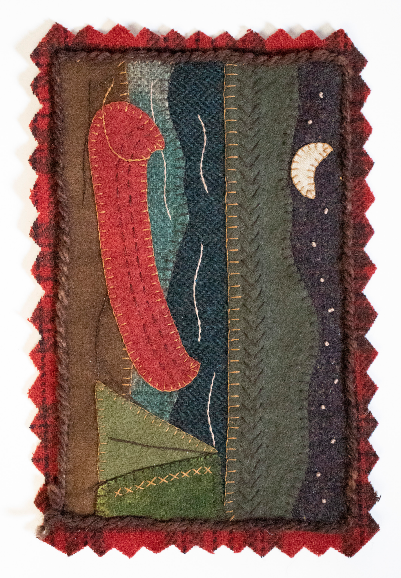
© 2020 Rebekah L. Smith This pattern is for personal use only.